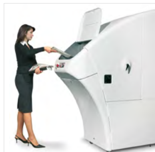
INNOVATIVE SHREDDING SYSTEM BASED ON A TURBINE COMBINED WITH HIGH SPEED ROTATING BLADES

ACCESSORIES: Kobra Compactor C-500 (art. code 99.101) compresses and reduces the volume of shredded paper by 4 to 5 times – CONSUMABLES: 400 litre plastic waste bags (10 pcs, art. code 51.221) – Filter Bags (10 pcs, art. code 51.225) – Security level screens: 002 (art. code 51.205), 003 (art. code 51.204), 004 (art. code 51.203), High security level screens: 005 (art. code 51.202), 006 (art. code 51.201).