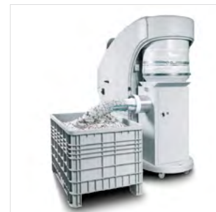
KOBRA COMPACTOR C-500 reduces by 4-5 times the volume of the shredded paper. Shredded and compacted paper can be collected into any type of container or into plastic waste bags. Compacting paper increases security of one level (ISO/IEC 21964).