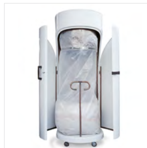
Kobra Cyclone (standard version) utilizes a 400 litre plastic waste bag. Full bags are easily removed and disposed of assisted by the built-in-trolley.