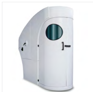
Rear window for easy checking of waste bag level.